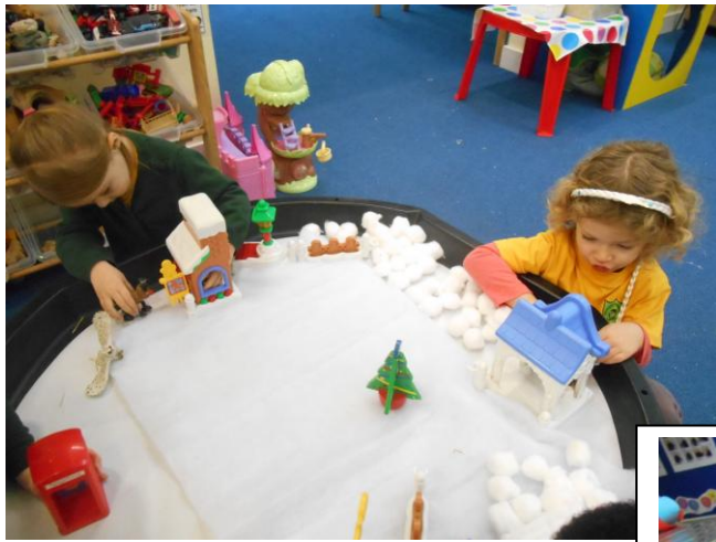
We use the new Christmas happy land