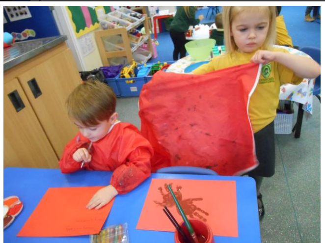
We made a reindeer picture using our hands.