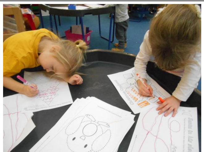
We carefully followed the lines on the Christmas pictures.