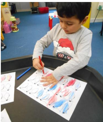
We made repeating pattern Christmas lights.